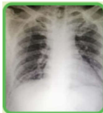
Fig. 1: Initial X ray

CECT Abdomen and pelvis: No solid organ injury or free fluid in the abdomen (Fig. 2 and 3).