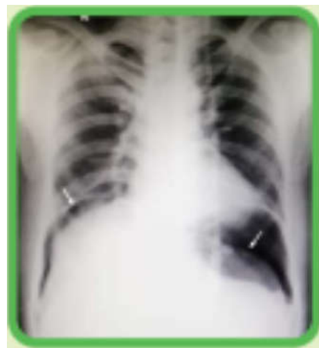
Fig. 4 Chest X ray after re-admission