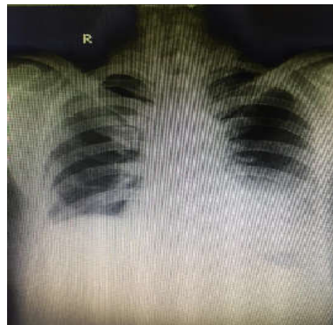
Fig. 5: X ray at the time of discharge