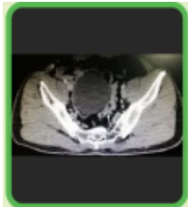
Fig. 2: Initial CT scan white arrow - Sigmoid colon

Immediately taken to OR for explorative laparotomy. Primary closure of sigmoid colon perforation and loop ileostomy was done and he was discharged after complete recovery a week later (Fig. 5).